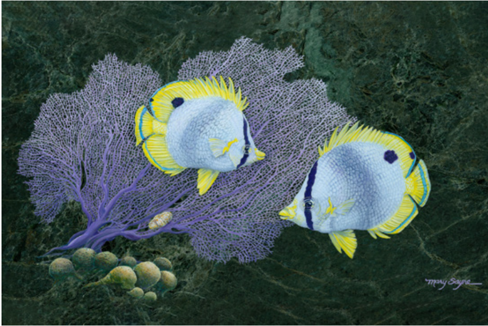
i BUTTERFLIES 14" x 22" Acrylic on Antique Verde Marble

Spotfin Butterfly fish make their home near a purple seafan on the coral reef.