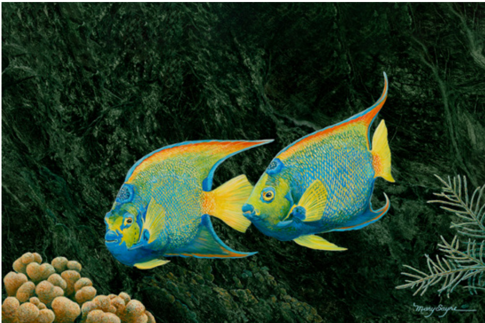
i DANCING ANGELS 13" x 22" Acrylic on Antique Verde Marble

Spotfin Butterfly fish make their home near a purple seafan on the coral reef.